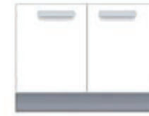
2. VG84 (P)