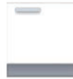
1. VG54/60 (PI, PD)