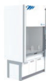
1. BECOME RB