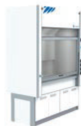
1. BECOME D