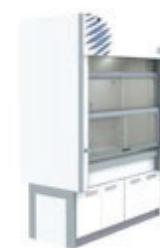
2. BECOME Elite Low