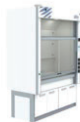
1. BECOME Elite